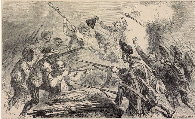
BATTLE OF BUNKER HILL.